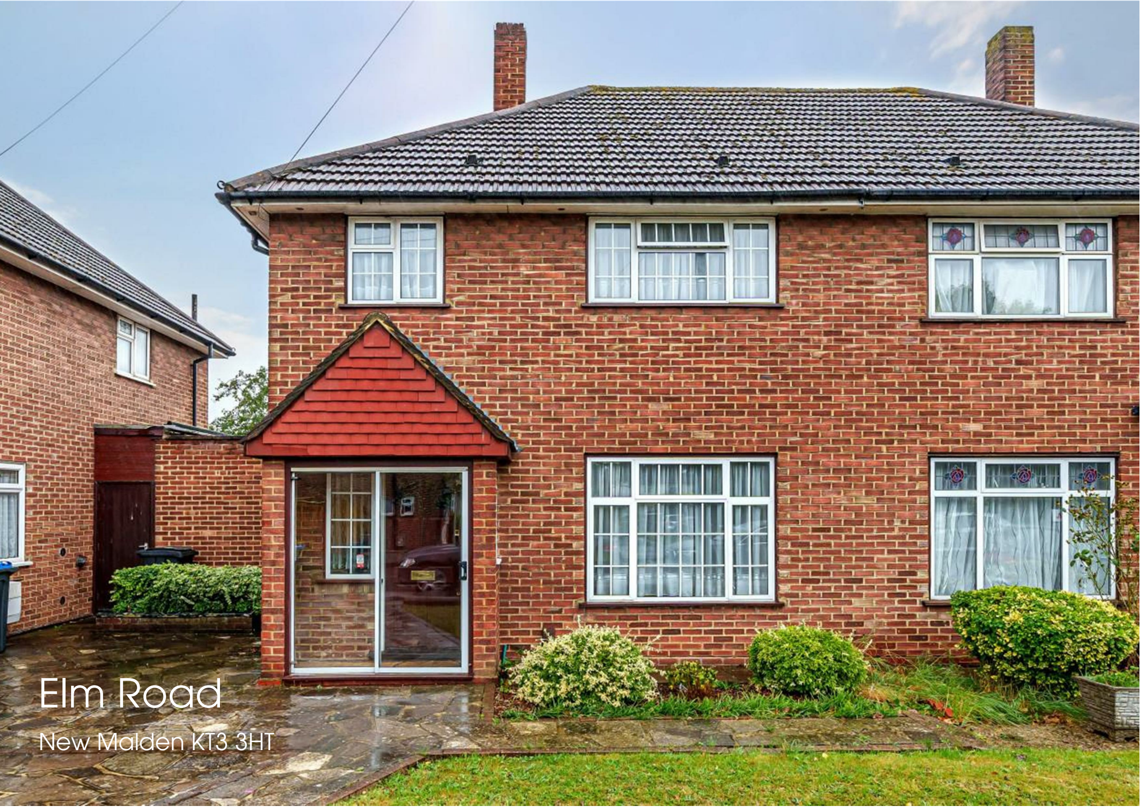
Elm Road New Malden KT3 3HT